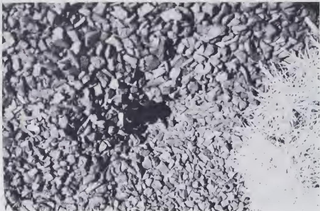
Fig 4: Entrance to P. chapmani burrow in mound of pebbles, from the type locality.

to be generically distinct from Pseudomys , with L. forresti being the type species'. Watts (1976) supports Mahoney's view that only one species is involved in Tate's (1951) L. forresti group but describes a second species, L. lakedownensis Watts, 1976, in this group. Baverstock et al. (1976), based on chromosomal and biochemical evidence, supported the maintenance of Leggadina as a separate genus 'comprising only L. forresti and L. lakedownensis .